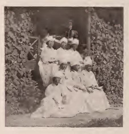
GROUP OF CHRISTIAN GRANDMOTHERS.

Shamanism, Buddhism and Confucianism are the three religions in Korea to-day. They have had undisputed sway over the hearts and minds of the people, and what is the result? Superstitions of the grossest forms; Results licentiousness and immorality universal; corruption of False and oppression everywhere. From the hour of his Faiths birth until the spirit leaves the body the Korean is surrounded and tormented by the innumerable spirits with which Shamanism fills the air and Buddhism his mind. Poverty is general. Woman is held in low esteem,